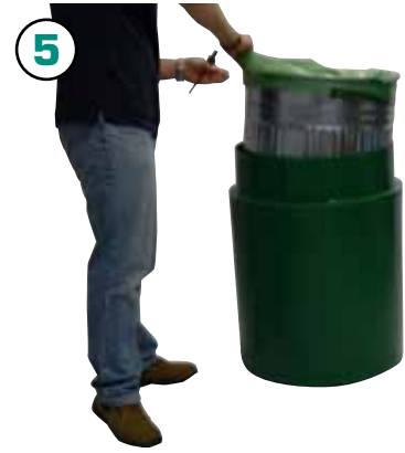
Place steel liner back inside of plastic body.