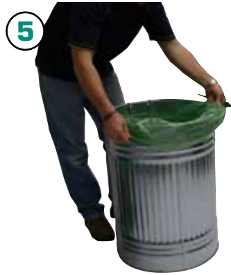
Place a 100 litre Leafield bag in the bin and stretch over the edges of steel liner.