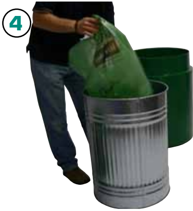
Remove existing bag from steel liner.