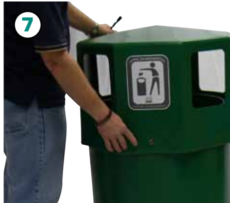
Push in the plunge lock to engage and secure the lid.