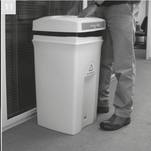
Replace hood so that label faces the front of the bin and lines up with any logos or personalisation