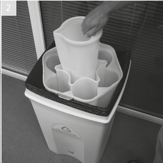
Grip central excess liquid resevoir by top handle and lift from central core