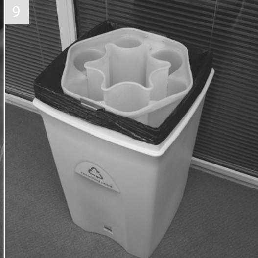
Drop cup holder down to its lowest level so that the front and rear clips hook over the bin edge