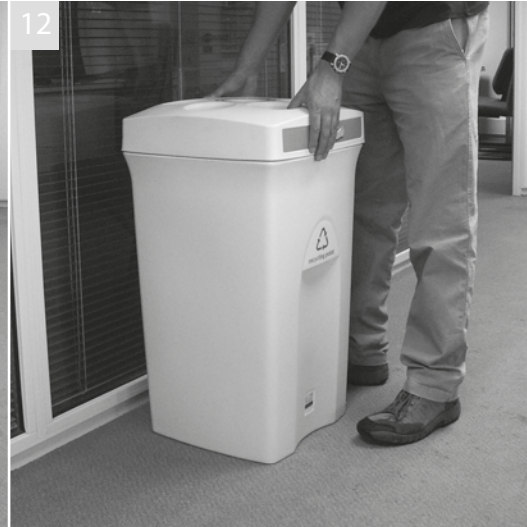
Push down ensuring the hood is seated at its lowest position