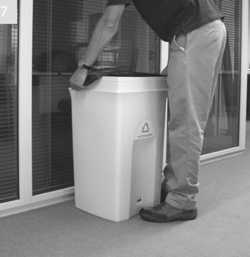
Stretch liner over the bin body and push down into the bin