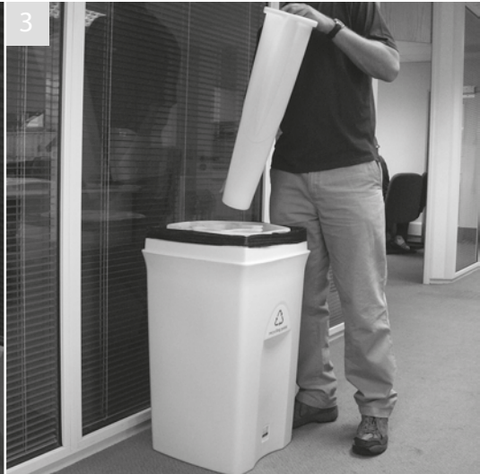
Remove excess liquid resevoir and empty contents