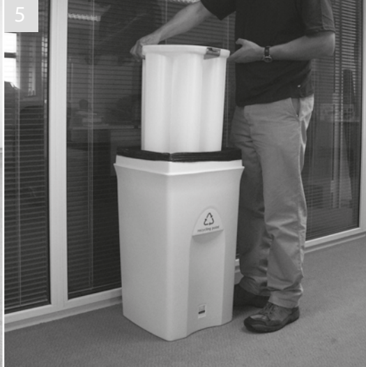
Lift cup holder upward clearing bin body. Cups will remain in the sack