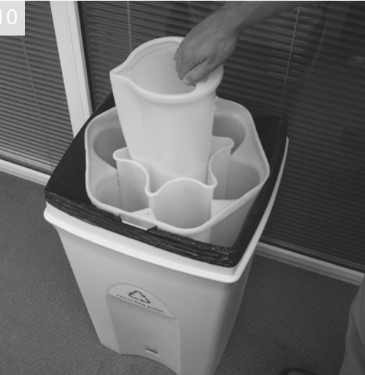
Replace excess liquid reservoir into central core