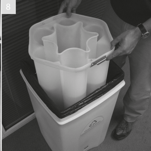
Replace cup holder orientate so that metal clips align with the front and back of the bin