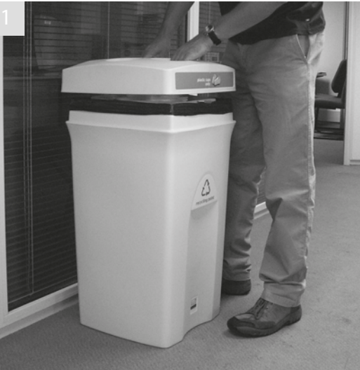
Grip hood and lift upwards and clear bin body