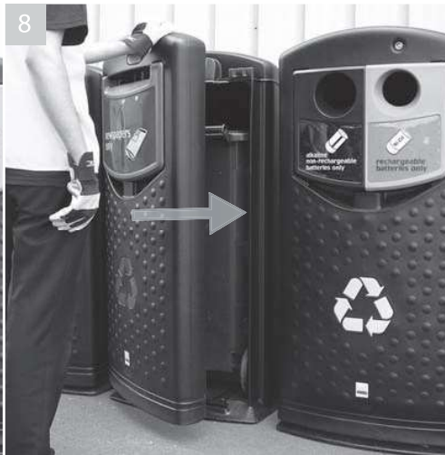
8 Ensure liner is flat and stable on bin base before pushing door closed