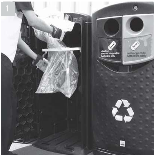
1 Feed sack through retention frame and pull down so that the open end meets the frame