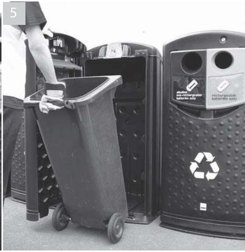
5 Remove the liner from bin body supporting weight on wheels