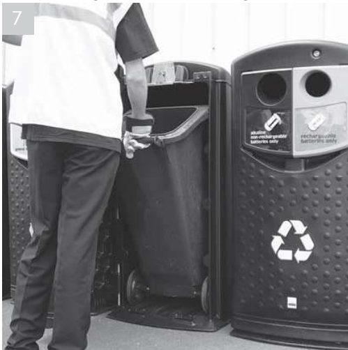
7 Replace liner rolling over lip on base, ensuring handle is facing outwards