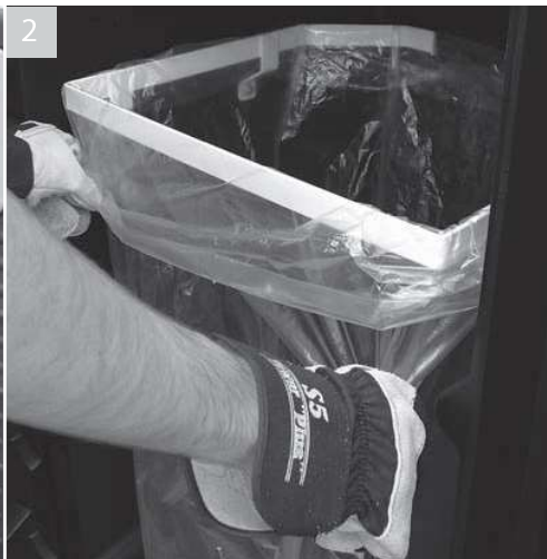
2 Stretch the sack over the frame ensuring the sack is taut and overlapping on all edges