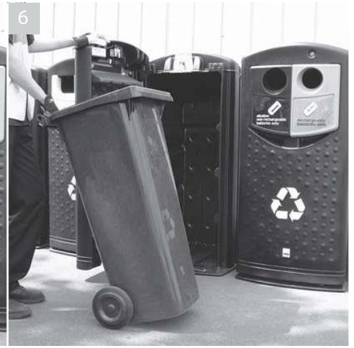
6 Roll liner free from bin and empty