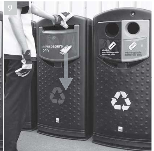
9 When at closed position door will drop down and engage lock automatically