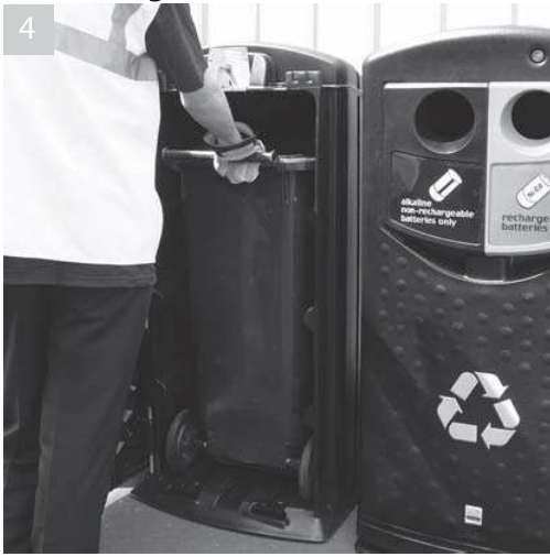
4 Grip liner by handle and tilt away from bin pivoting on liner wheels