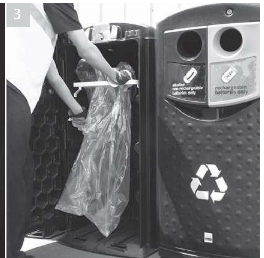
3 To release sack from retention frame. Drop down and gather liner, remove liner from bin body and dispose.