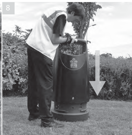
Replace hood positioning over liner and lower onto base