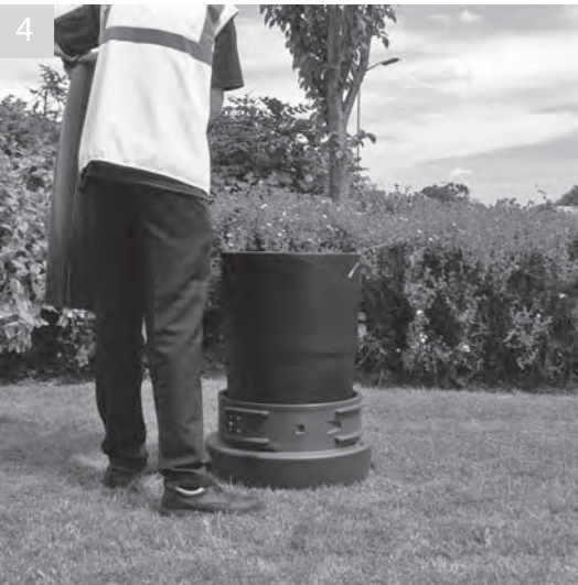
Place hood onto ground