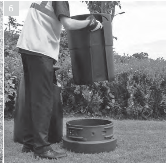
Lift liner up and over base and empty