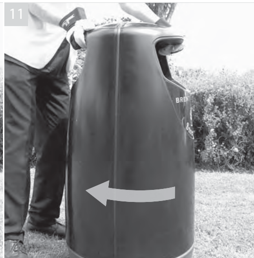
Continue rotating the hood until the lock is heard to engaged