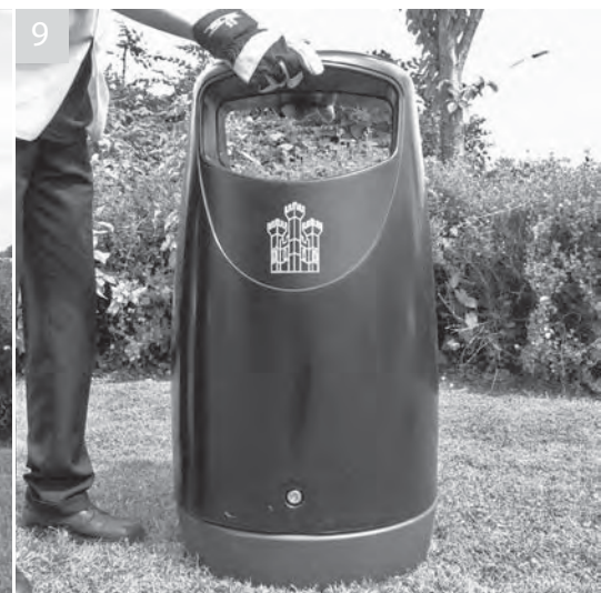
Twist hood until it drops to lowest position