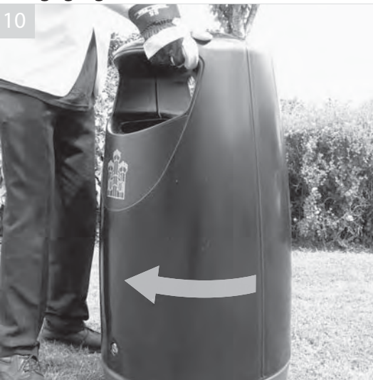
With bin hood resting on base, twist hood clockwise