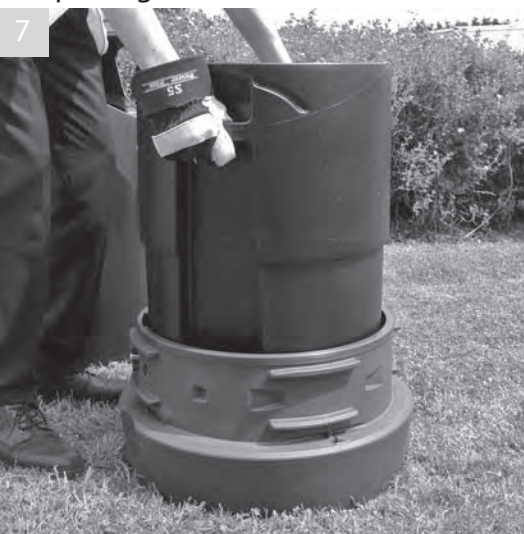
Relocate liner into base