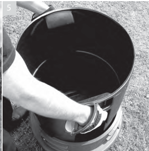
Using the two handles grip liner