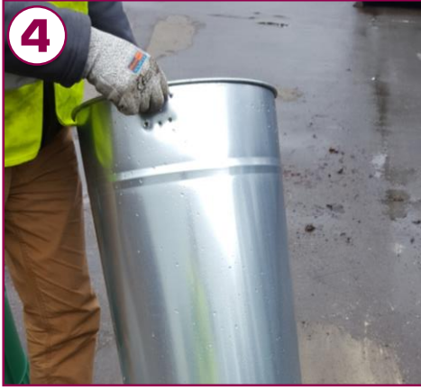
4 Remove the liner and empty the waste.