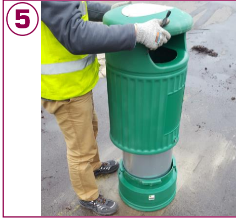
5 Replace the empty liner and bin hood