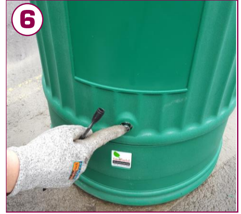
6 Push in the plunge lock to engage and secure the lid