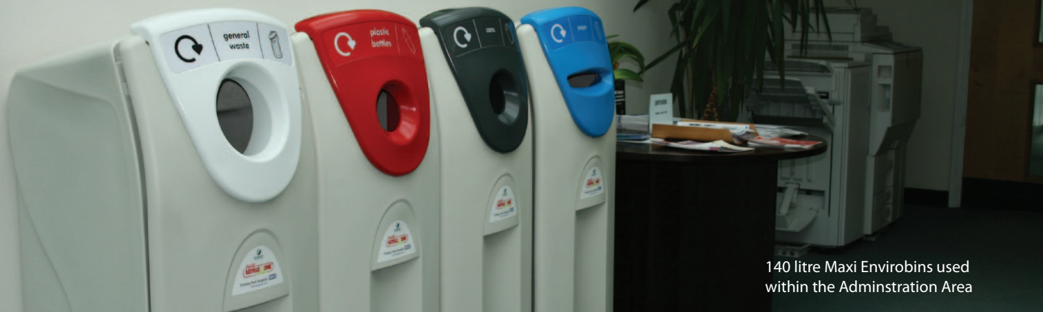
140 litre Maxi Envirobins used within the Administration Area

The 'Recycle Zone' comprises 72 Envirobins from Leaffield Environmental sited throughout the hospital in restaurants, foyers and offices. Differently sized Envirobins have been used depending on the waste stream to be collected and the physical space available.